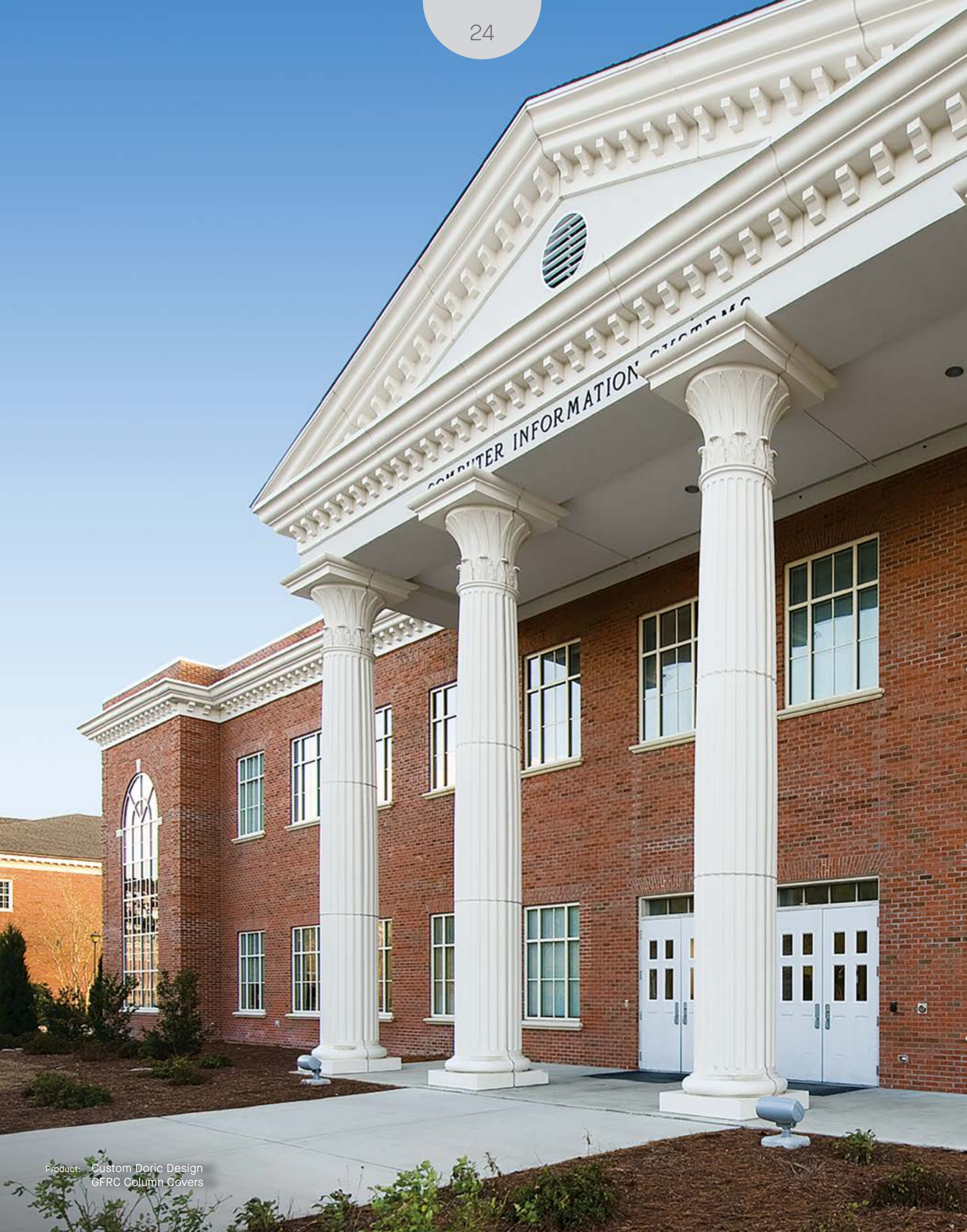
Product: Custom Doric Design GFRC Column Covers