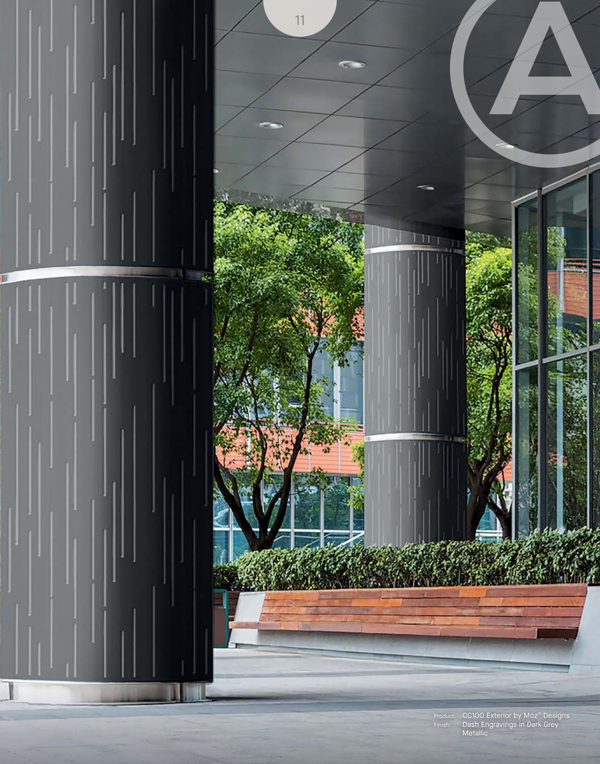
Product: CC100 Exterior by Móz™ Designs Finish: Dash Engravings in Dark Grey Metallic