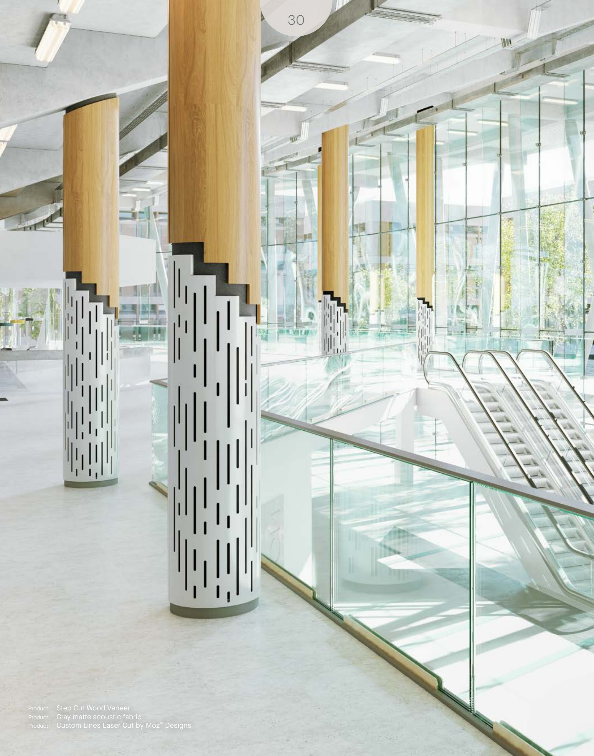
Product: Step Cut Wood Veneer Product: Gray matte acoustic fabric Product: Custom Lines Laser Cut by Móz™ Designs