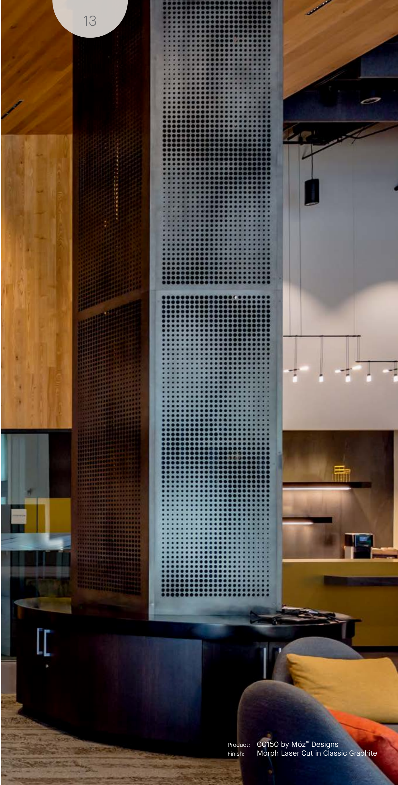
Product: CC150 by Móz™ Designs Finish: Morph Laser Cut in Classic Graphite