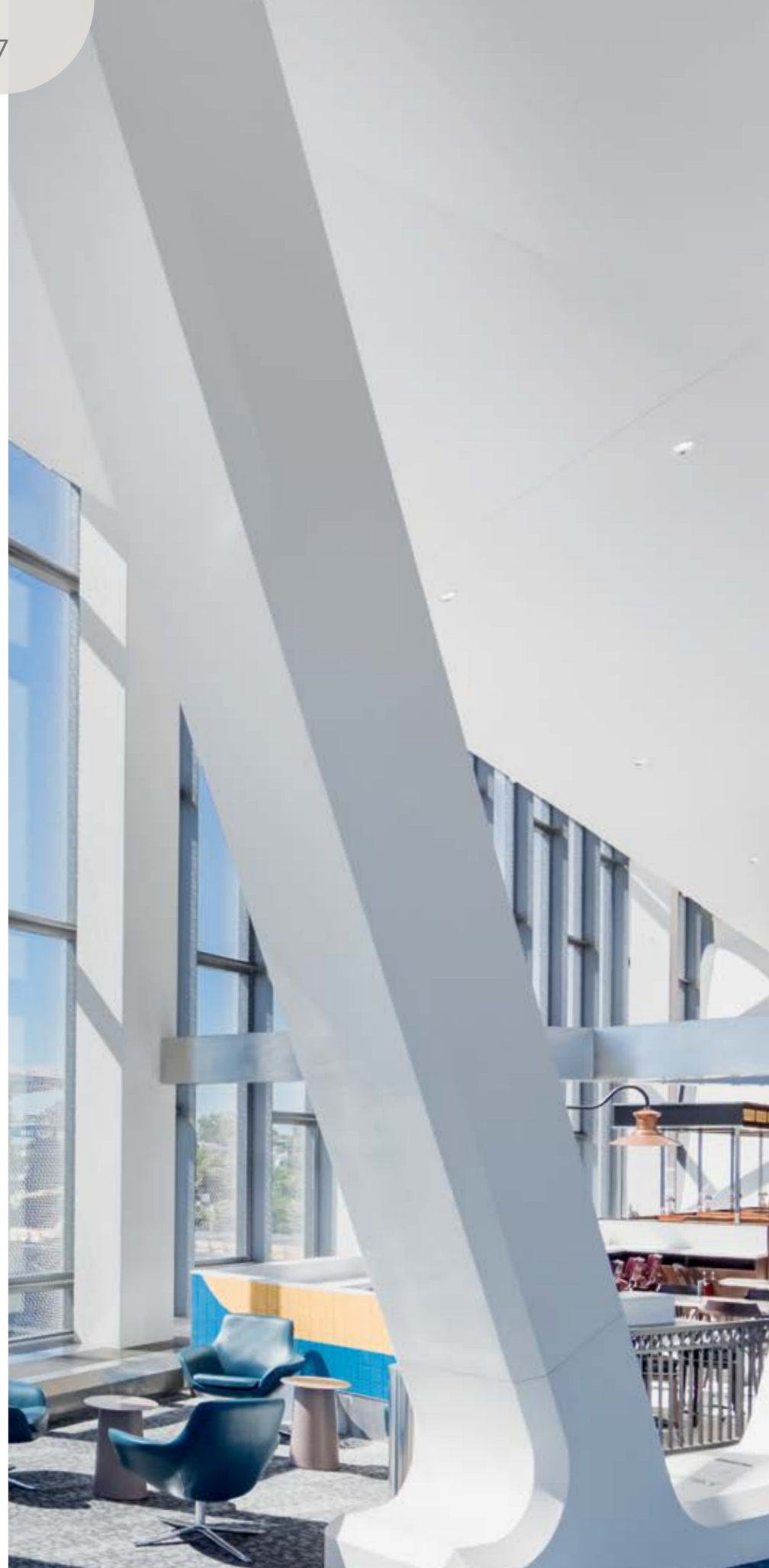
GRG & GFRC