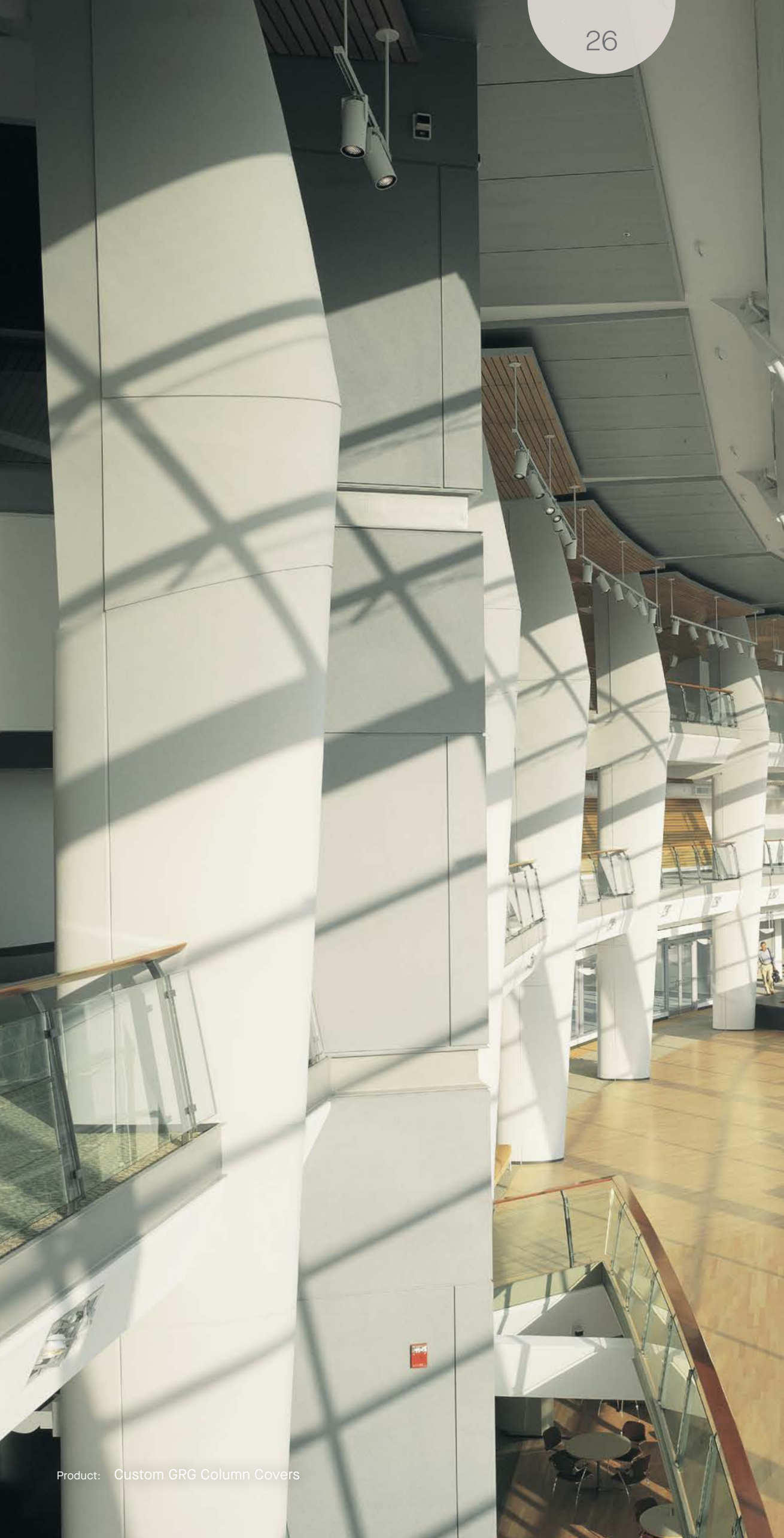
Product: Custom GRG Column Covers