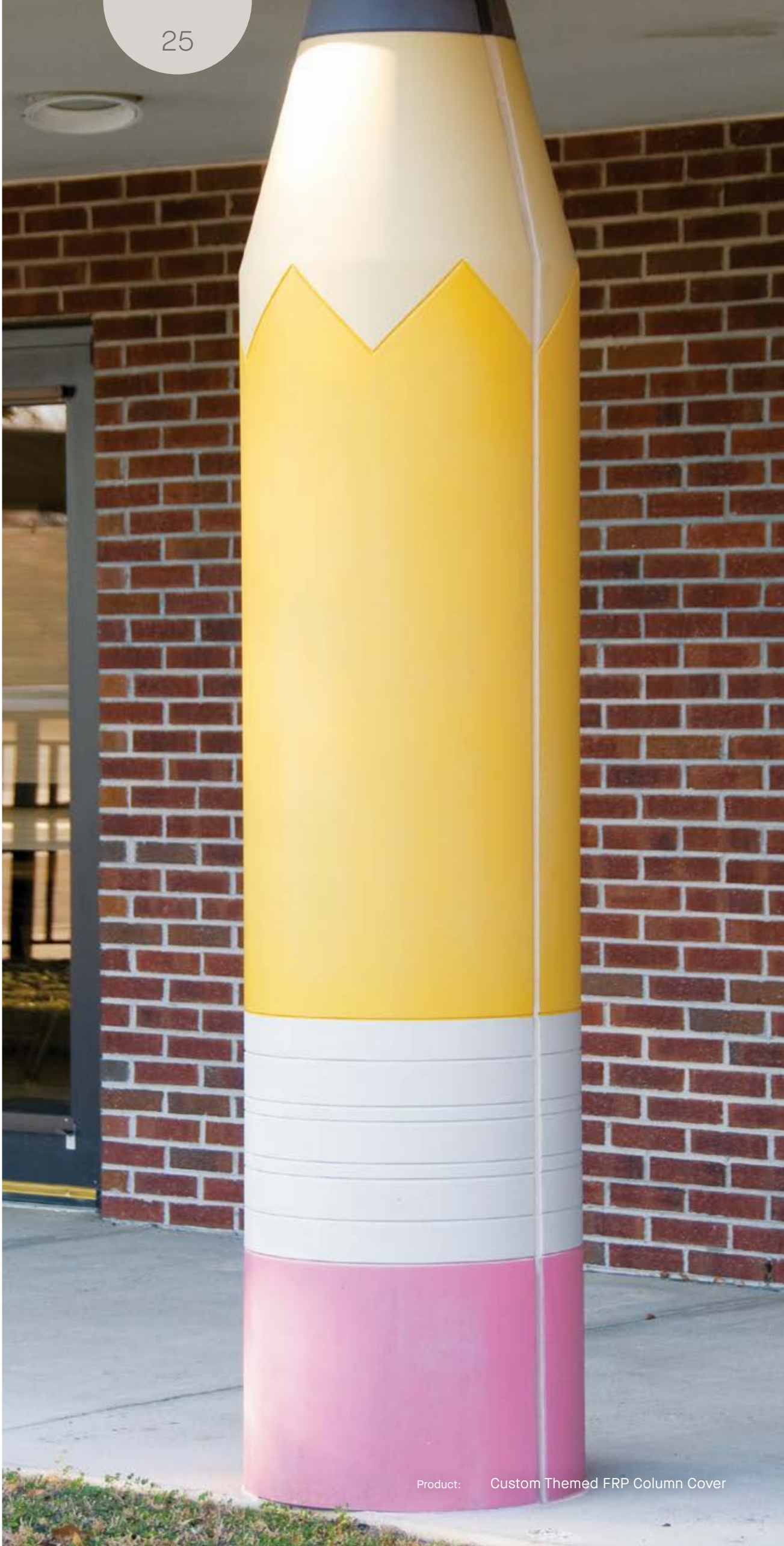
Product: Custom Themed FRP Column Cover