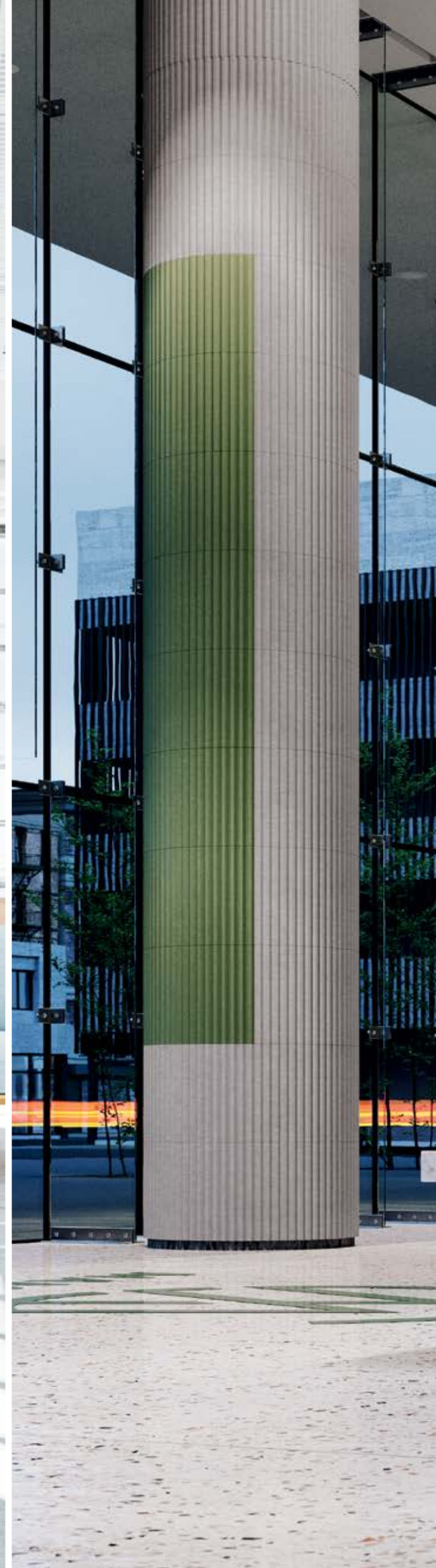
Product: Tubular by Turf Design Colors: 01 Cream & 94 Coral