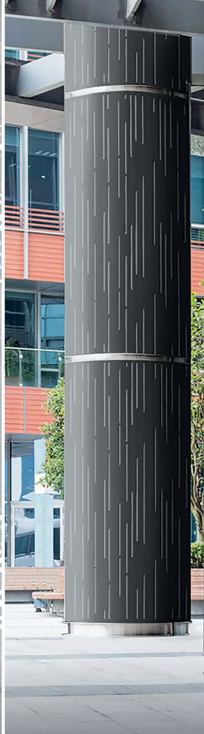
Product: CC100 Backlit by Móz™ Designs Finish: Custom Petals Laser Cut in White Matte