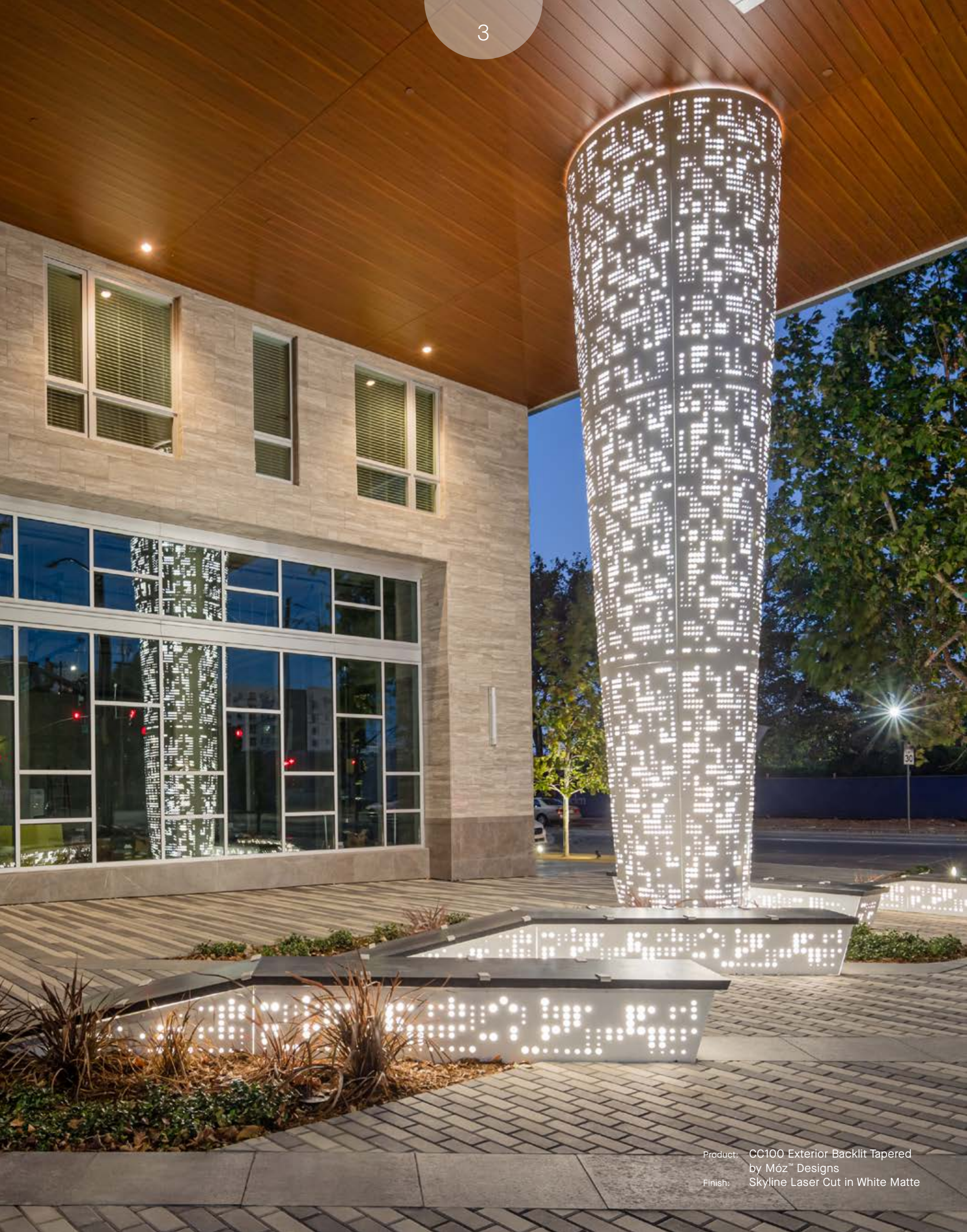
Product: CC100 Exterior Backlit Tapered by Móz™ Designs Finish: Skyline Laser Cut in White Matte