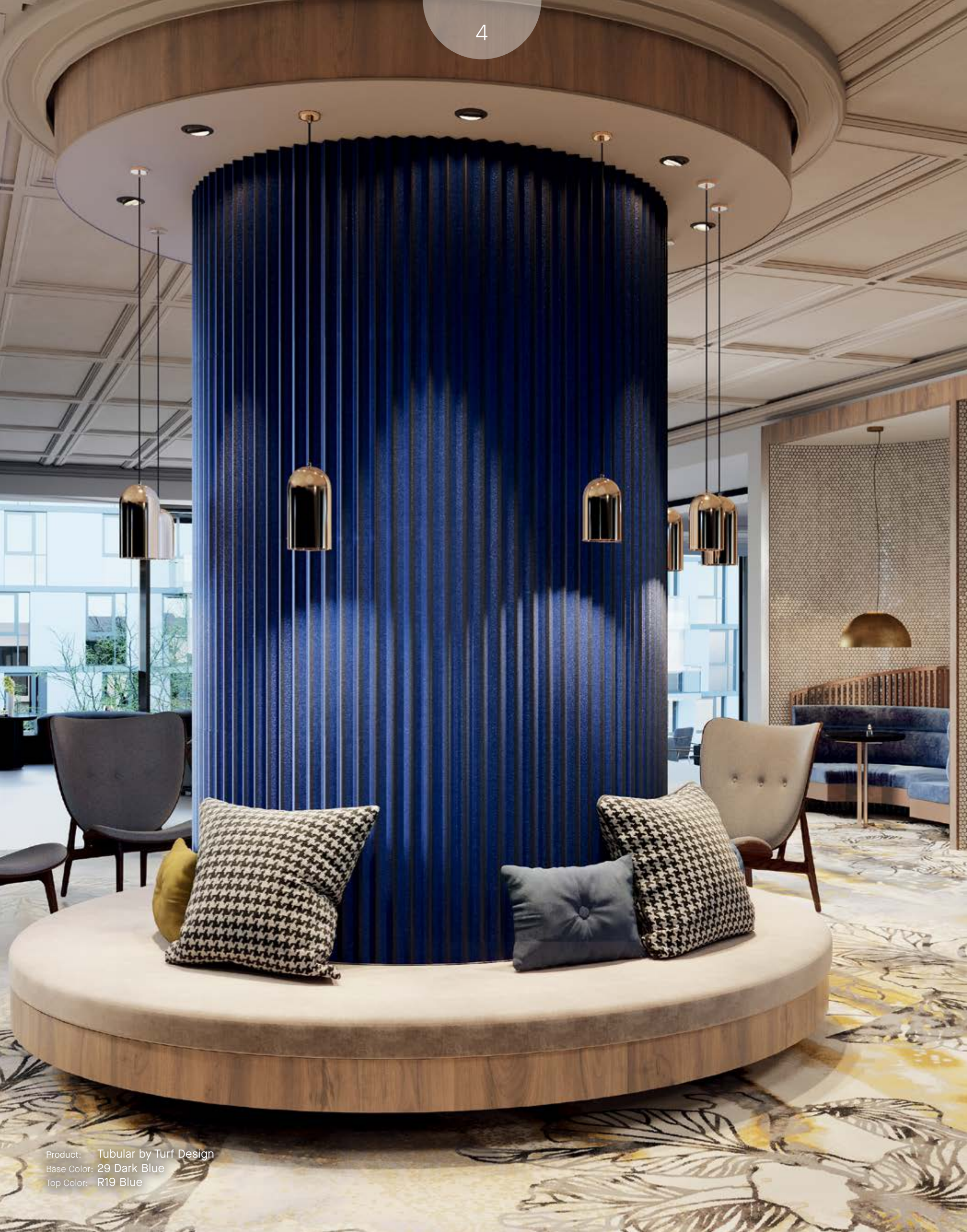
Product: Tubular by Turf Design Base Color: 29 Dark Blue Top Color: R19 Blue