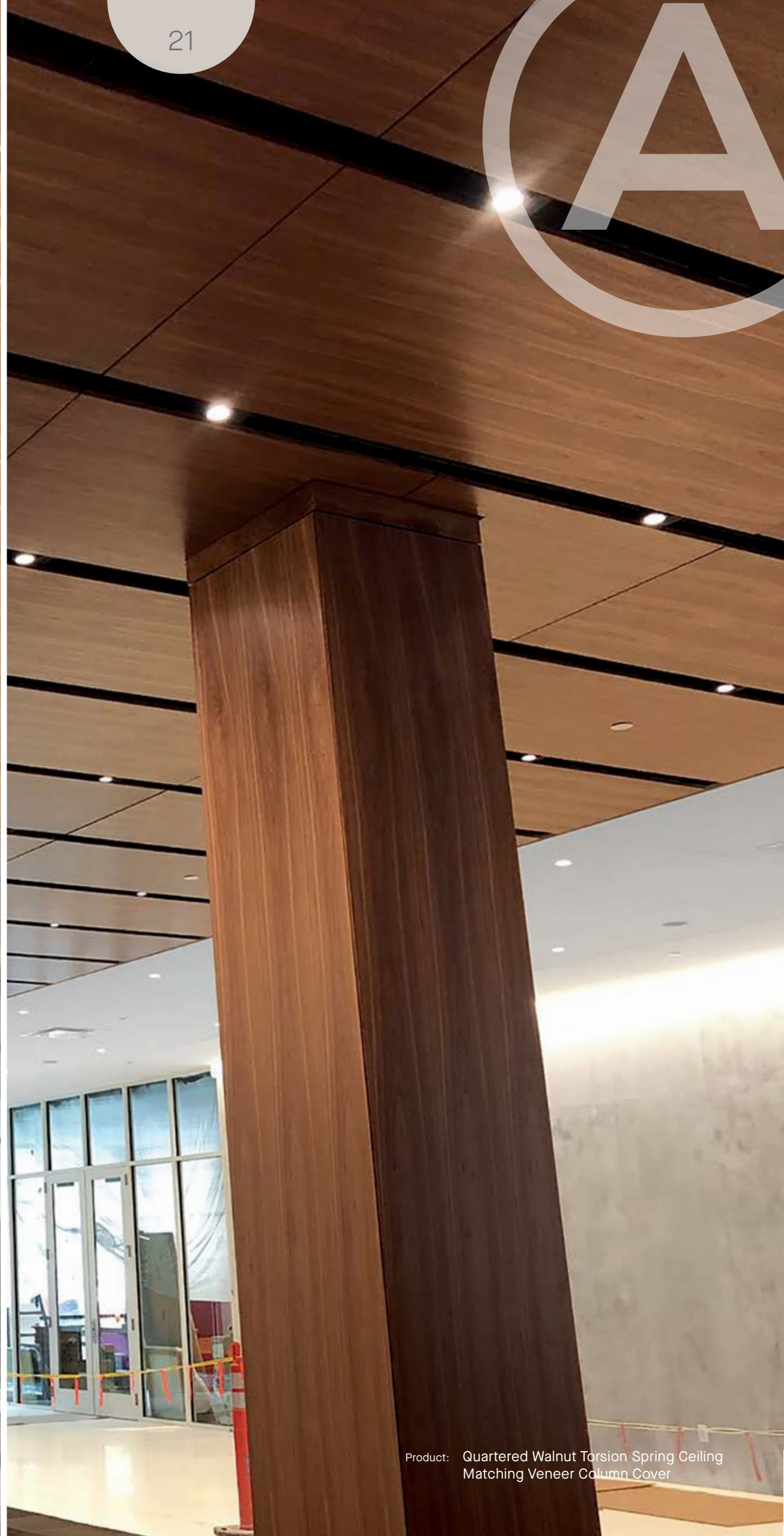
Product: Quartered Walnut Torsion Spring Ceiling Matching Veneer Column Cover