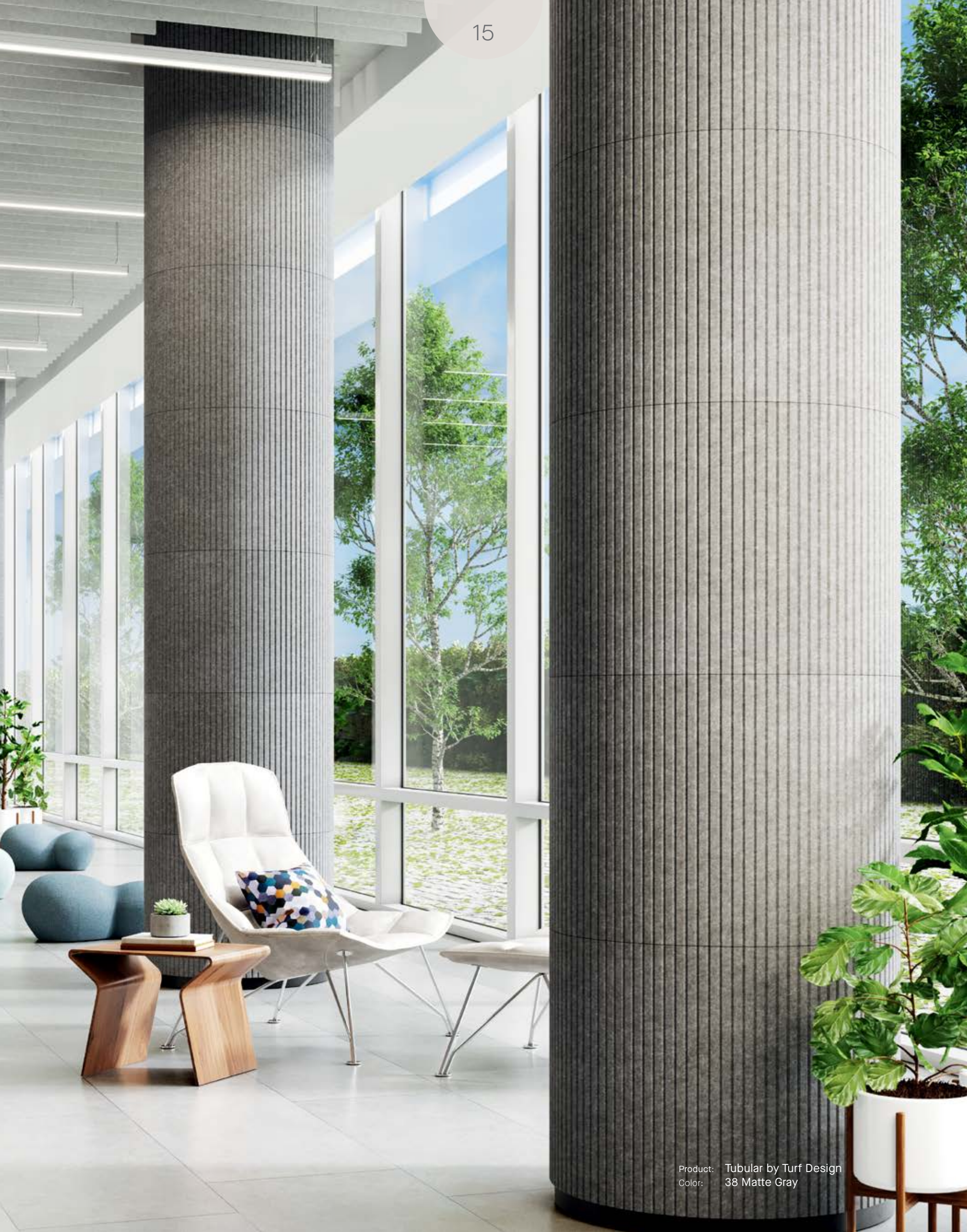
Product: Tubular by Turf Design Color: 38 Matte Gray