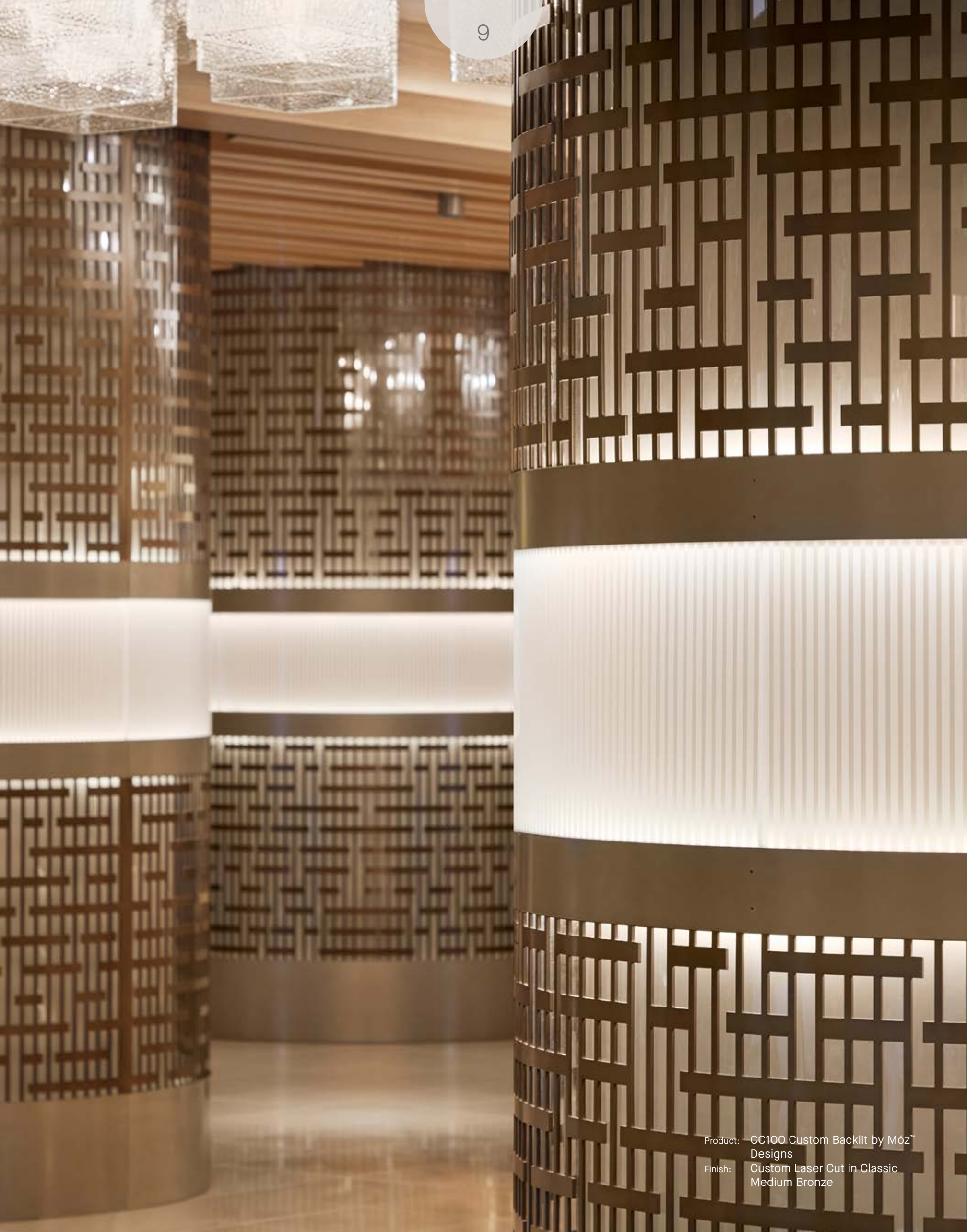
Product: CC100 Custom Backlit by Móz™ Designs Finish: Custom Laser Cut in Classic Medium Bronze