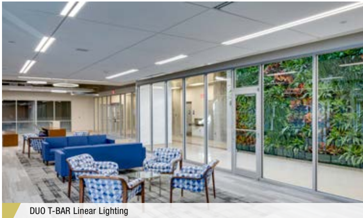
DUO T-BAR Linear Lighting

Redefining the way luminaires interface with the ceiling grid through innovative on-the-grid mounting techniques.