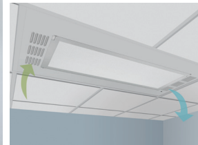
Calla® Health Zone™ AirAssure® Square Tegular panels with Prelude® ML® 15/16" Exposed Tee suspension system

CAD/Revit® drawings at: armstrongceilings.com/cadrevit