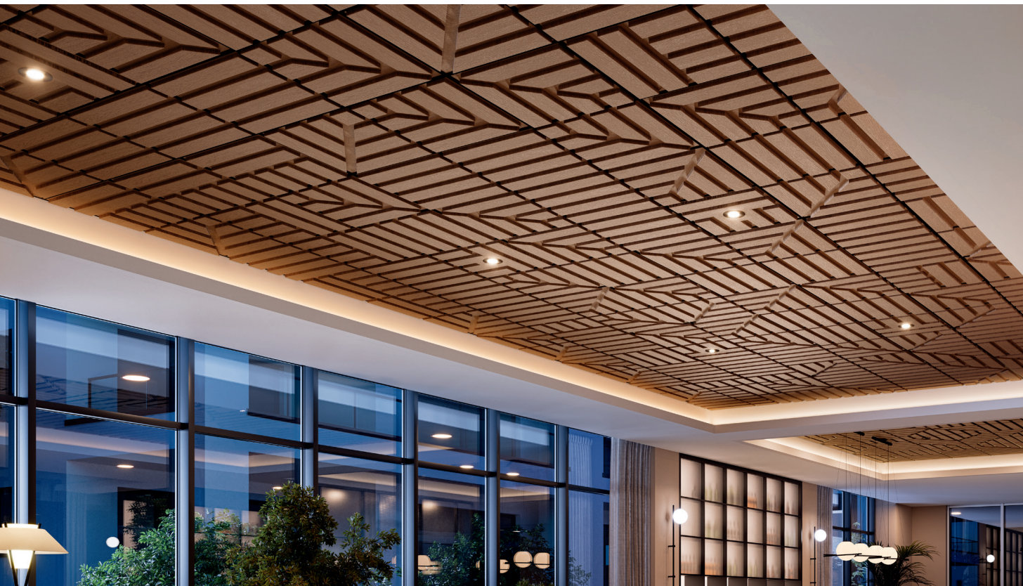
CastWorks Metaphors Parquet design ceiling panels in Walnut

Precast 24" × 24" Glass-Fiber Reinforced Gypsum (GRG) panels are now available in additional designs and wood-look finishes as a quoted option.