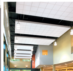
▲ Cirrus® Square Lay-in panels with Prelude® XL® 15/16" suspension system

DESIGNFLEX® A New World of Choice for Ceiling Systems