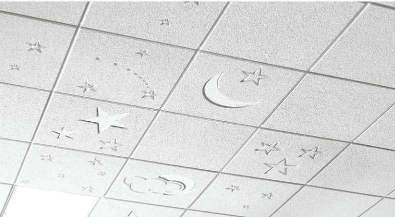
Cirrus® Themes™ Stars™ panels with Suprafine® XL® 9/16" suspension system