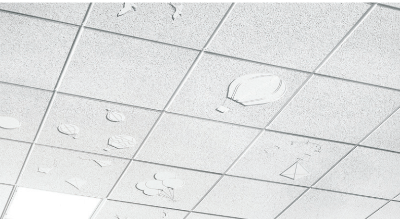
Cirrus® Themes™ Things That Fly™ panels with Suprafine® XL® 9/16" suspension system