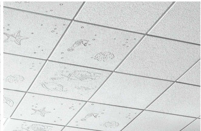
Cirrus® Themes™ Under The Sea™ panels with Suprafine® XL® 9/16" suspension system