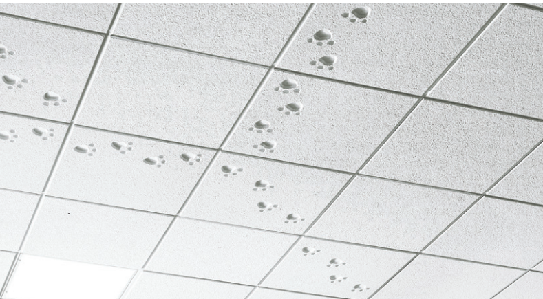
Cirrus® Themes™ Critters™ panels with Suprafine® XL® 9/16" suspension system

Medium texture panels with playful designs for a fun addition to your projects.