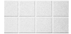
Second Look I panel – Scoring creates nominal 12" x 12" squares