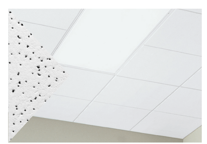
Fine Fissured™ Second Look® II panels with Suprafine® XL® 9/16" suspension system

Economical panels; Scored plank or geometric visual with standard acoustical performance.