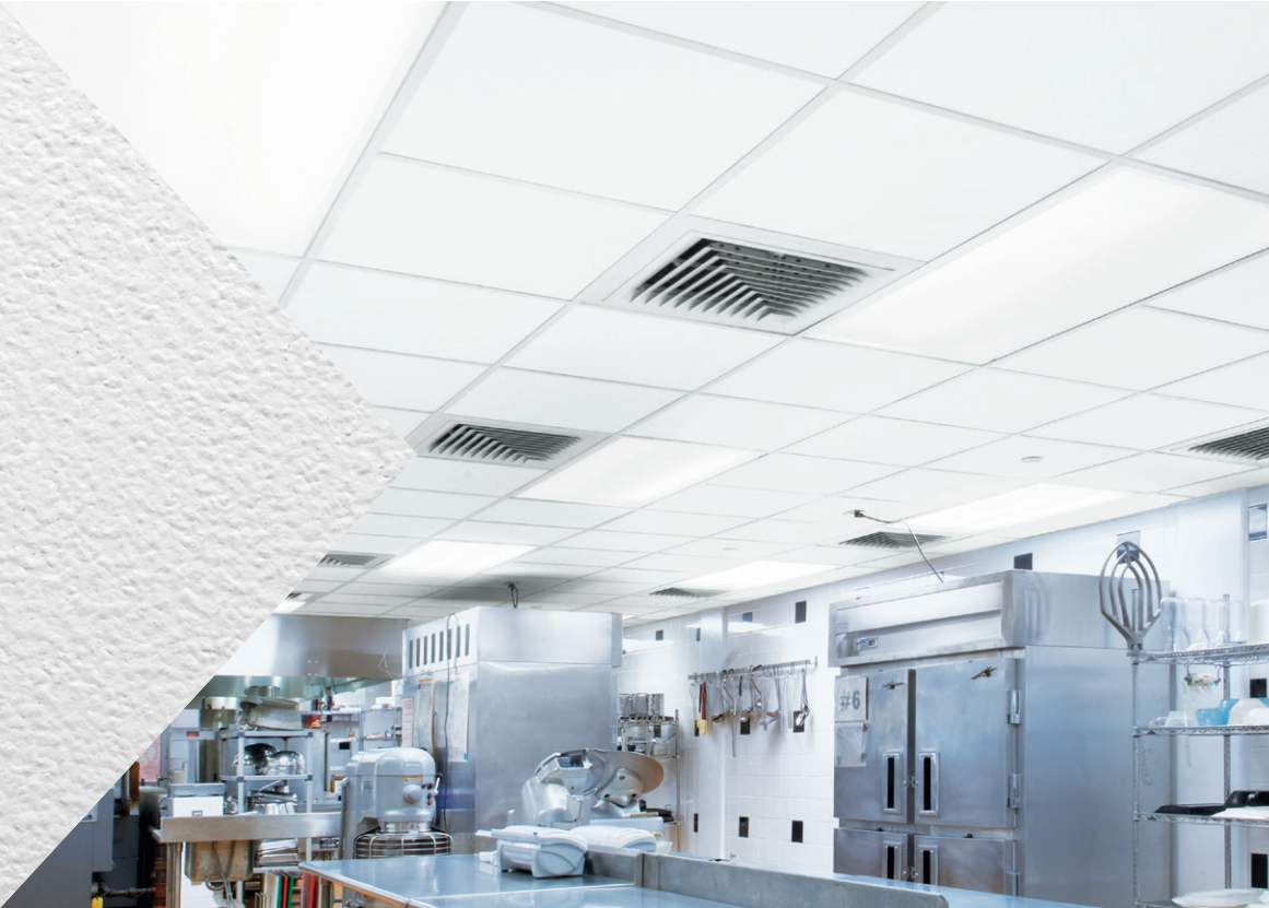
Kitchen Zone™ 24" x 24" panels with Prelude® XL® 15/16" suspension system

CAD/Revit® drawings at: armstrongceilings.com/cadrevit