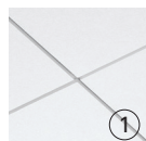
1. Lyra® Vector® with Prelude® XL® 15/16" suspension system

TechLine 877 276-7876 armstrongceilings.com/lyra