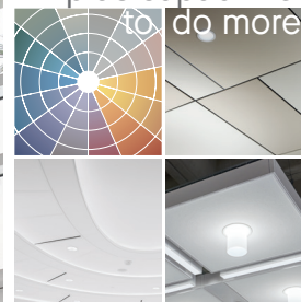
Lyra Vector panels with Prelude XL 15/16" suspension system

armstrongceilings.com/capabilities See more photos at: armstrongceilings.com/photogallery