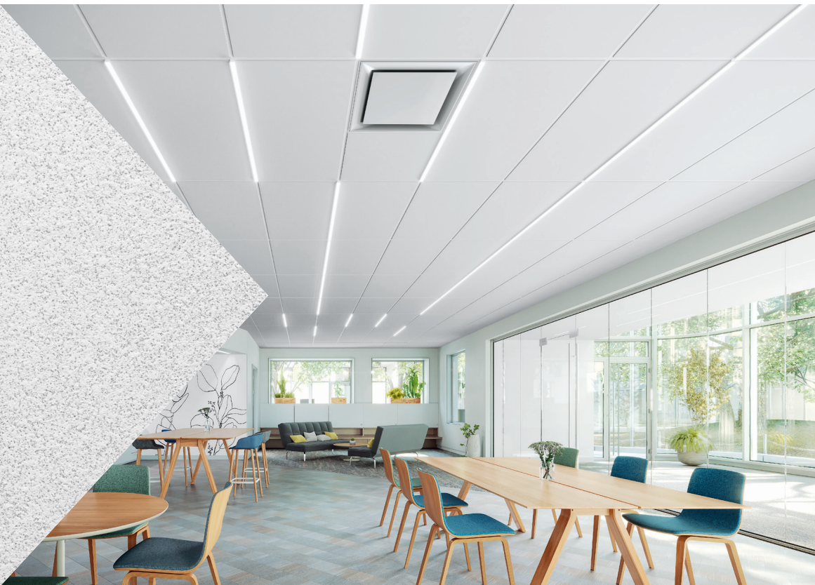
Ultima® Health Zone™ Tegular panels with Suprafine® 9/16" suspension system

CAD/Revit® drawings at: armstrongceilings.com/cadrevit