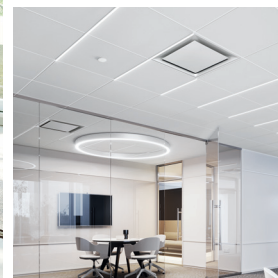
Perfect for education, office, and healthcare spaces

Fine texture mineral fiber ceiling; combines exceptional acoustical performance, sustainability, and functionality attributes in one go anywhere ceiling panel that is especially durable and aesthetically pleasing for every healthy space.