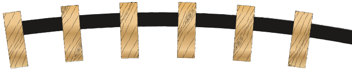
Flexible Dowel (optional)