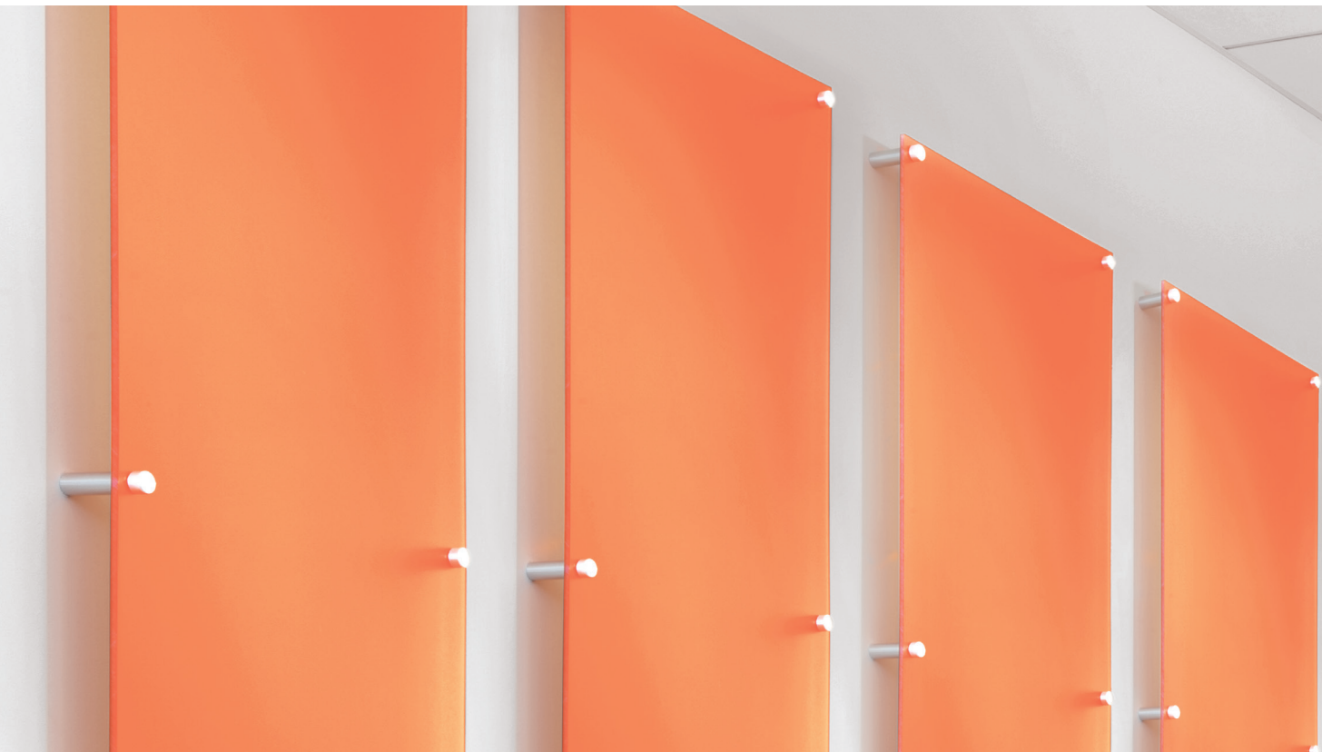
Infusions™ Walls 24" x 96" in Refined Tangerine

Wall System available in translucent colors and patterns that can be hung individually or in a group.