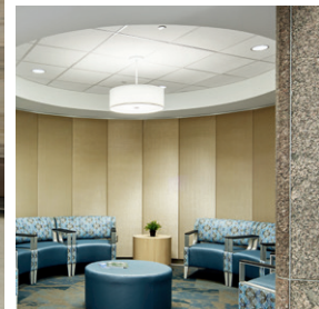
Optima® Health Zone™ Square Tegular panels with Prelude® XL® 15/16" suspension system