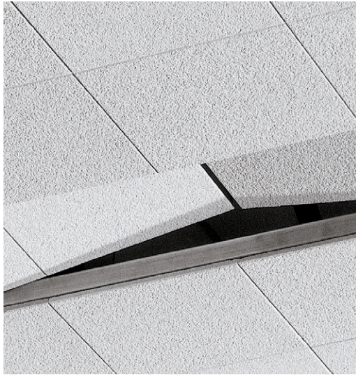
Prelude® Concealed suspension system

Sophisticated slotted suspension system with a narrow 1/4" reveal.