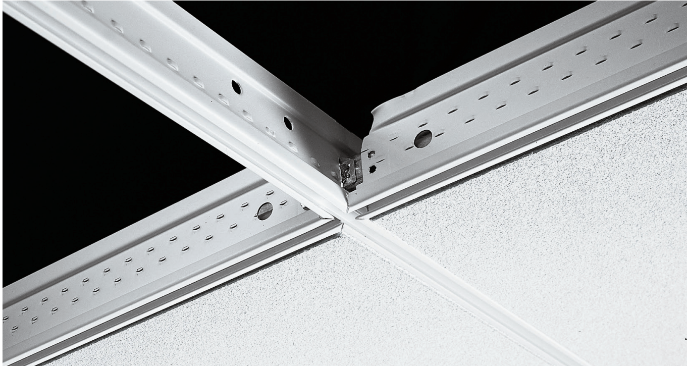
Silhouette 1/4" reveal suspension system

Sophisticated slotted 9/16" suspension system with a narrow 1/4" reveal.