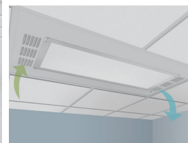
Ultima® Health Zone™ AirAssure® Tegular panels with Silhouette® XL® 9/16" suspension system

CAD/Revit® drawings at: armstrongceilings.com/cadrevit