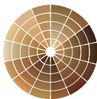
Custom Veneers and Finishes Available (extended lead times)