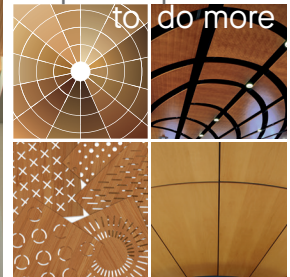
WoodWorks Channeled plank with W9 perforation in Natural Variations Maple

armstrongceilings.com/capabilities See more photos at: armstrongceilings.com/photogallery