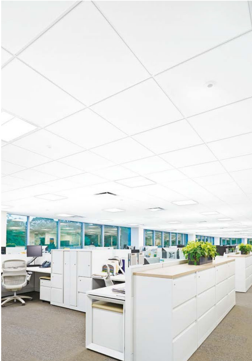
Calla® Ceiling Panels with Suprafine® XL® Suspension System