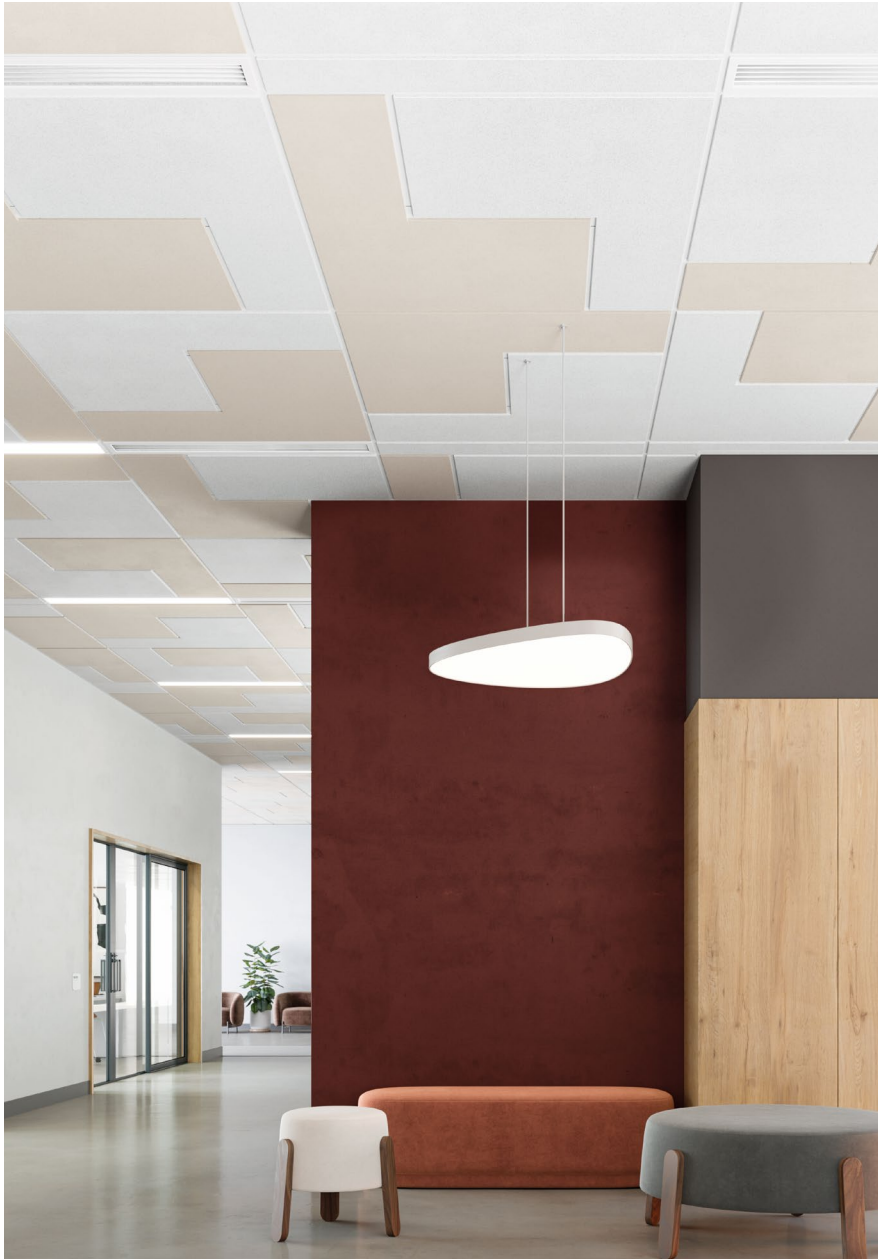
DesignStackz™ Ceiling Panels with Suprafine® XL® Suspension System