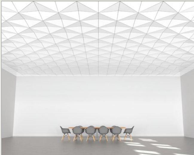
Pattern Gallery Number: TSSH 10