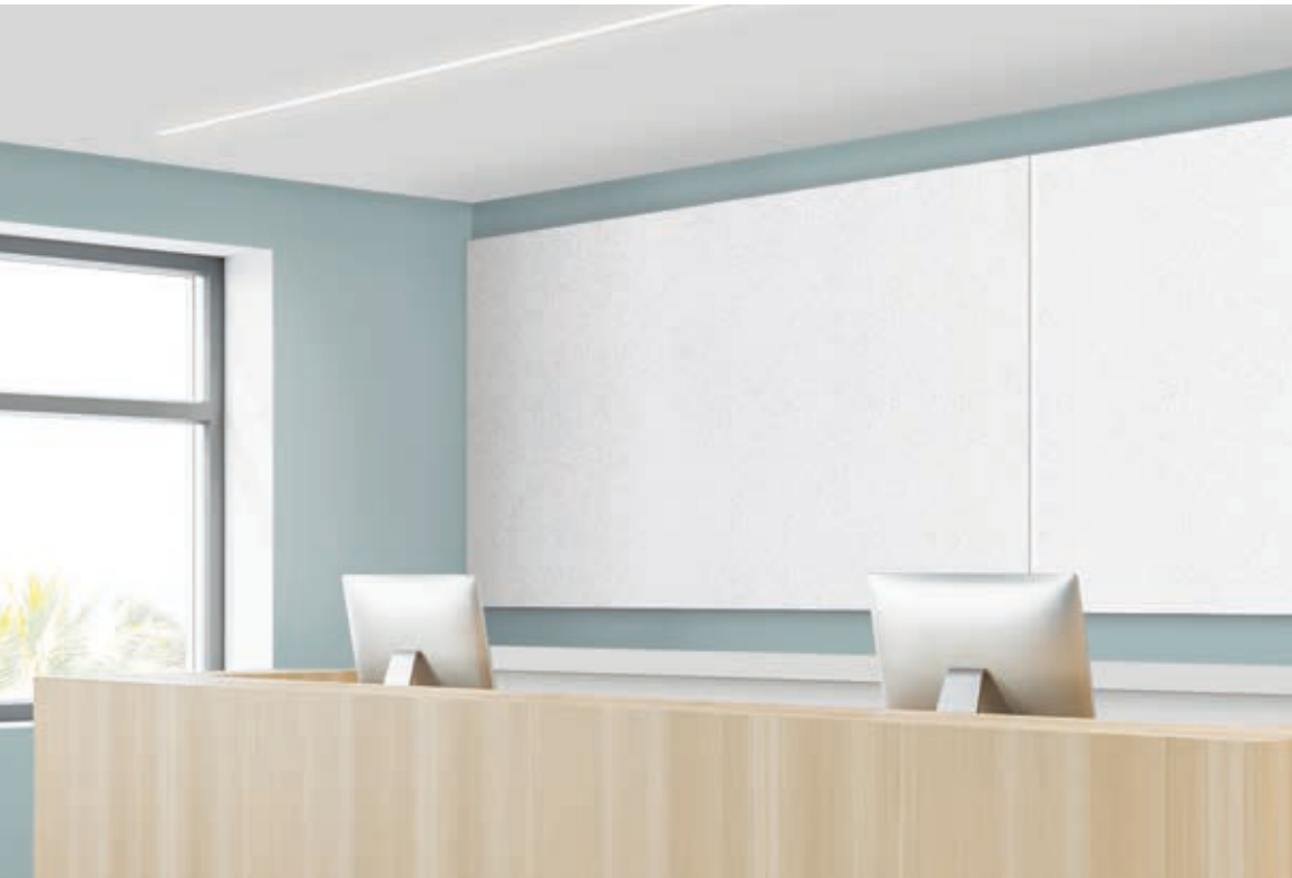
▲ Optima® PB Health Zone™ Wall Panels

Fine-textured wall panels that provide excellent sound absorption; meet USDA/FSIS guidelines and offer Sustain® performance.